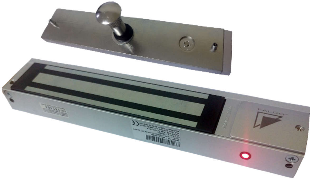
Compatible with ZL-300 or UI Bracket